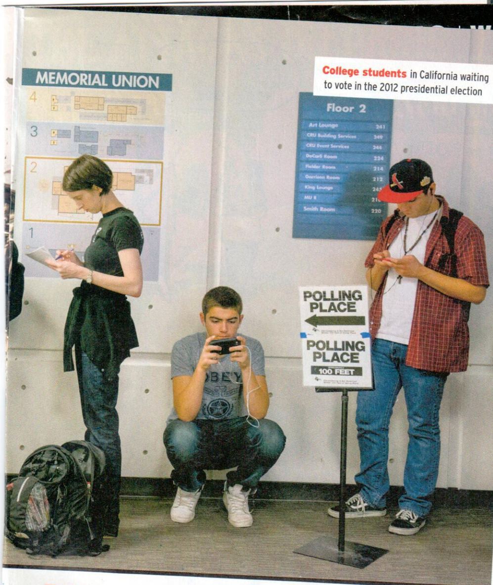
College students in California waiting to vote in the 2012 presidential election